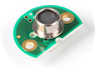
CM-3 Measuring cell 111 1615

Caution: Never touch the front area of the measuring cell with your hands or any other object!