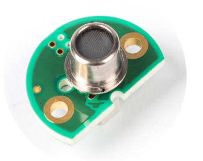
CM-4 measuring cell 260 0995

Caution: Never touch the front area of the measuring cell with hands or any other object!