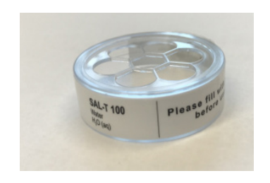
SAL-T 100 standard 260 1619

Empty SAL-T standard with RFID tag for adjustment and calibration at 100 % rH with pure water