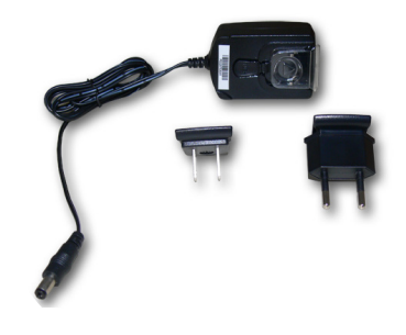
Power supply unit EU/US 260 0505

Power supply for LabStart / LabSwift / LabTouch Attention: Please use the power adapter supplied by Novasina only.