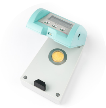
LabSwift-aw (with battery) 260 0179