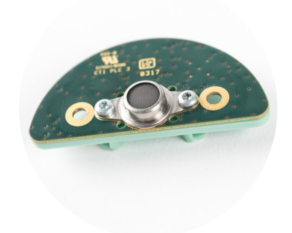
aw-Sens ELS 260 1615

Caution: Never touch the front area of the measuring cell with your hands or any other object!