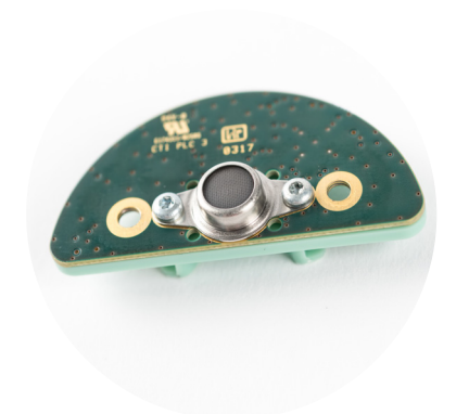
aw-Sens ENS 260 1609