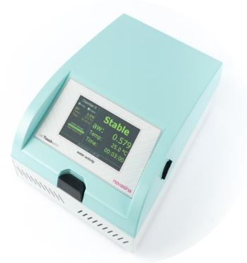
LabTouch-aw with CM-2 Sensor 260 1916