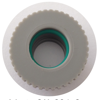
Adapter SAL-SC / nSens 260 1143