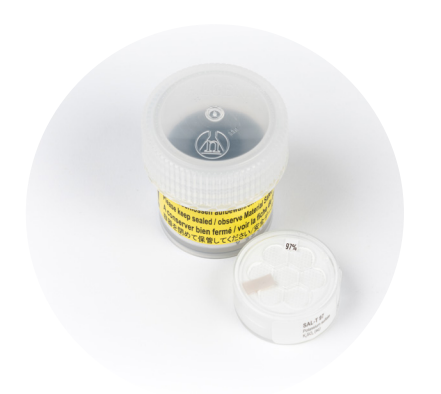
SAL-T/C salt standards UKAS