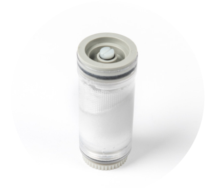
SAL-SC with UKAS certificate