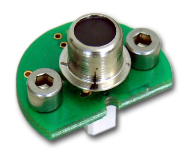
CM-2 Measuring cell 111 9983