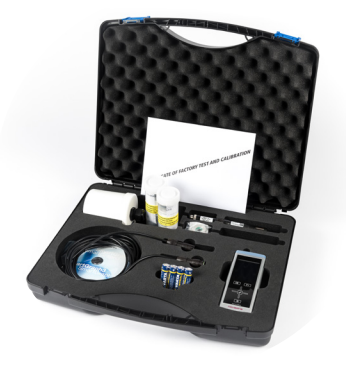
ClimMate-Set aw 260 1288