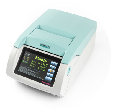
LabMaster-aw neo (ENS) 260 1500