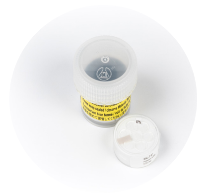
SAL-T/C salt standards