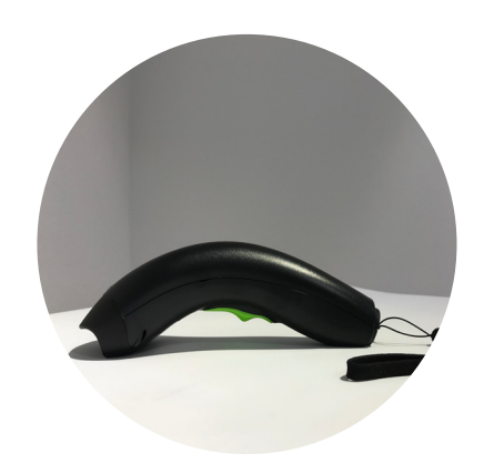
Wireless Barcode Scanner 260 1698