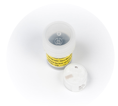
SAL-T salt standards