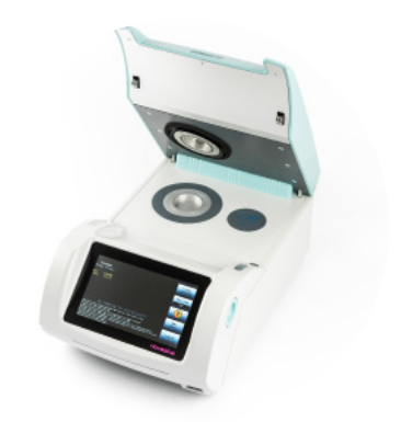
LabMaster-aw neo (ELS) 260 1700