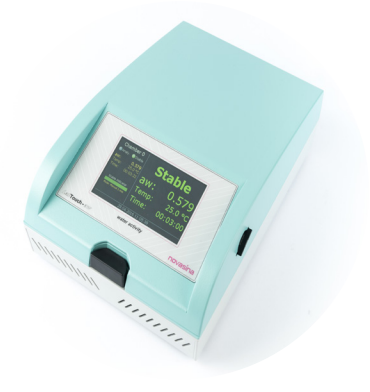
LabTouch-aw with CM-3 Sensor 260 1917