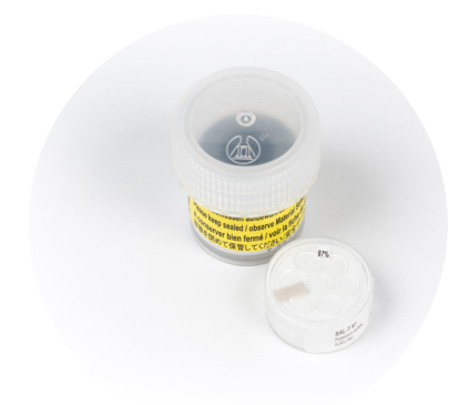
SAL-T salt standards