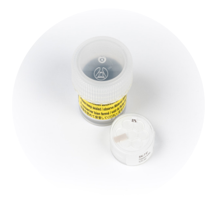
SAL-T salt standards