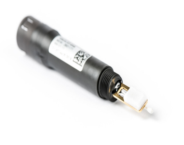
nSens-HT-ENS 260 1171

Digital nSens-HT humidity & temperature sensor with resistive electrolytic humidity and NTC temperature sensor. With nCap-PS protective filter cap. The calibration points are stored directly in the sensor. Calibration and adjustment is carried out with separately available calibration software nSoft-CAL. The sensor is pluggable and can be replaced very quickly and easily.