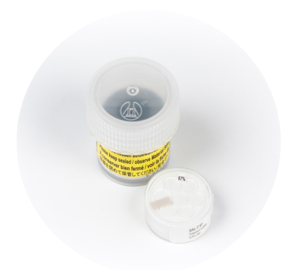
SAL-T/C salt standards