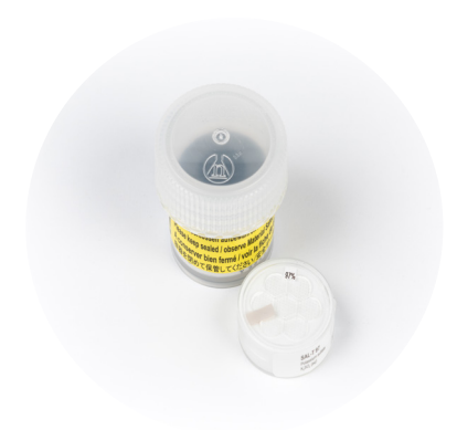
SAL-T salt standards