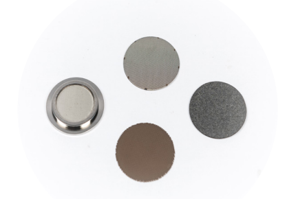
Special protection filters 111 1001 -> eVC-21 (10 pcs) 111 1003 -> eVC-26 (10 pcs) 111 7212 -> Redox (1pcs) 111 0995 -> eVALC (2 pcs)

For detailed information on the most suitable filter for your application, please consult the Novasina filter data sheet.