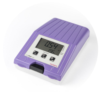
LabStart-aw 260 0992