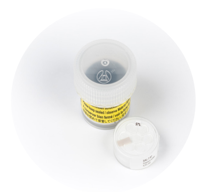
SAL-T/C salt standards