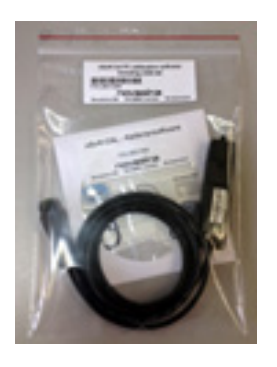
nSoft-CAL Set 260 1094