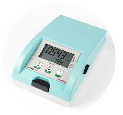
LabSwift-aw (without battery) 260 0177